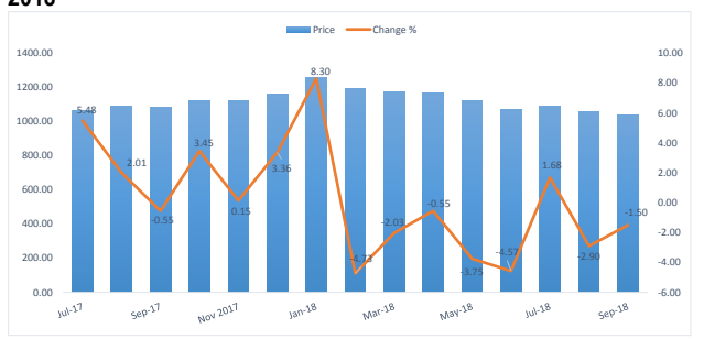
Figure 1: Emerging market index from July 2017 to September 2018